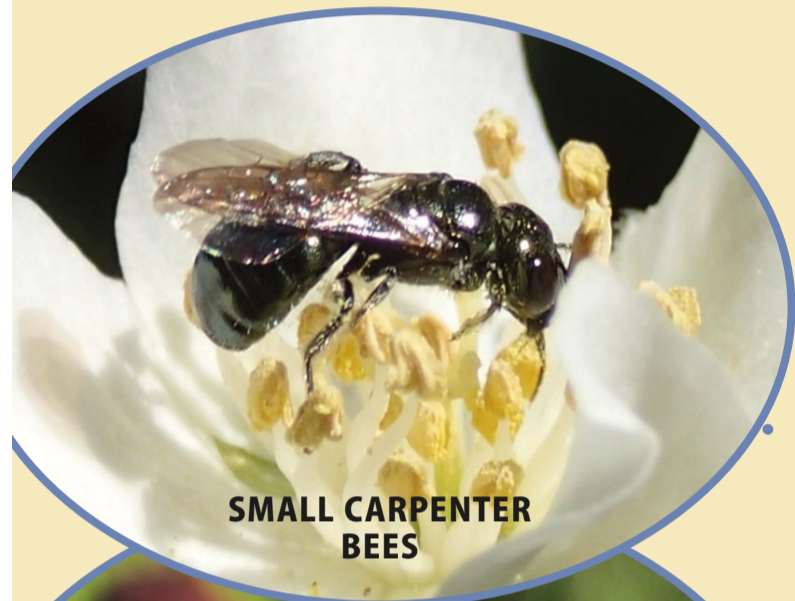
SMALL CARPENTER BEES