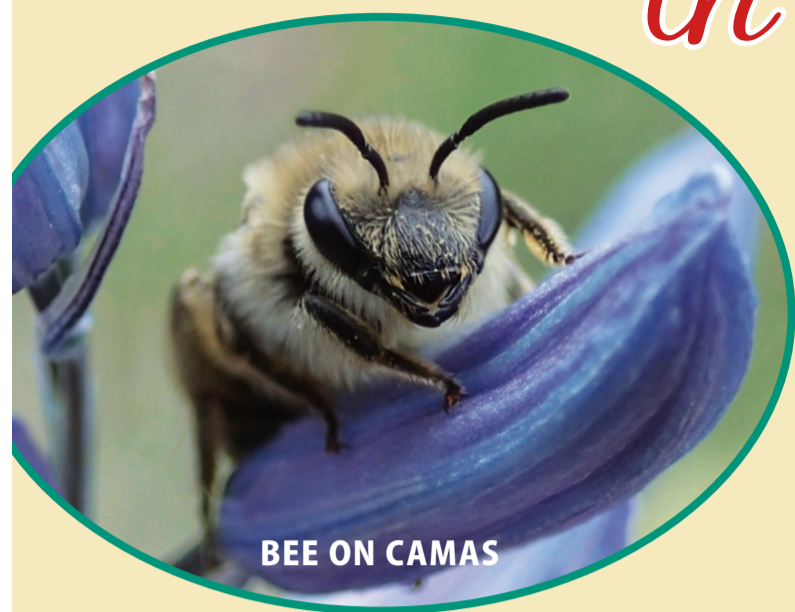
BEE ON CAMAS